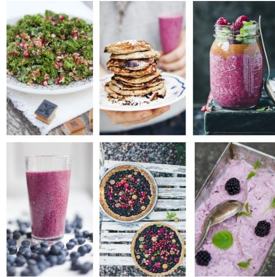
We've PICKED some of our favorite berry recipes, perfect for a relaxing summer weekend! ☀️ Find all of these and more at gkstori.es/berries