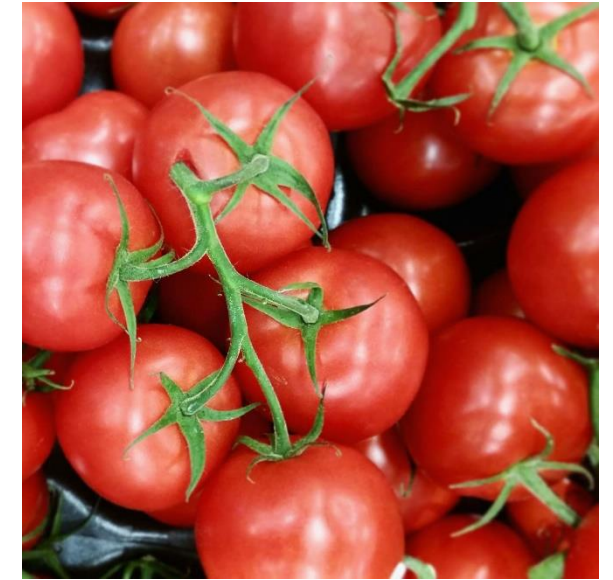
(**video post**) Some amazing produce at the #farmersmarket this weekend! What goodies did you find?